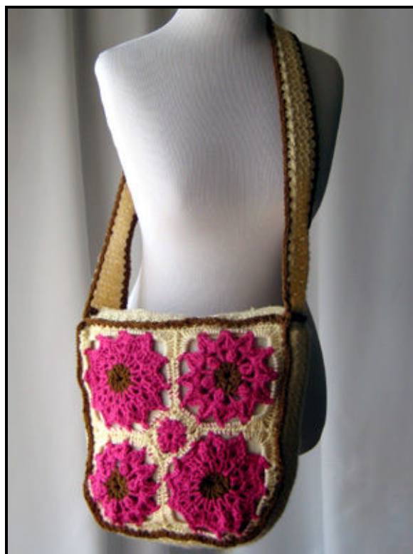
Pattern by CrochetKitten.com, Summer 2007.

Rnd 6. With Color A, join with sl st in any ch-6 sp. Ch 3 (counts as dc), 5 dc in same sp, ch 1, 6 dc in next ch-6 sp, ch 1, (6 dc, ch 3, 6 dc) in next ch-6 sp; sharp corner made. Ch 1, (6 sc, ch 1) in next 5 ch-6 sp; soft